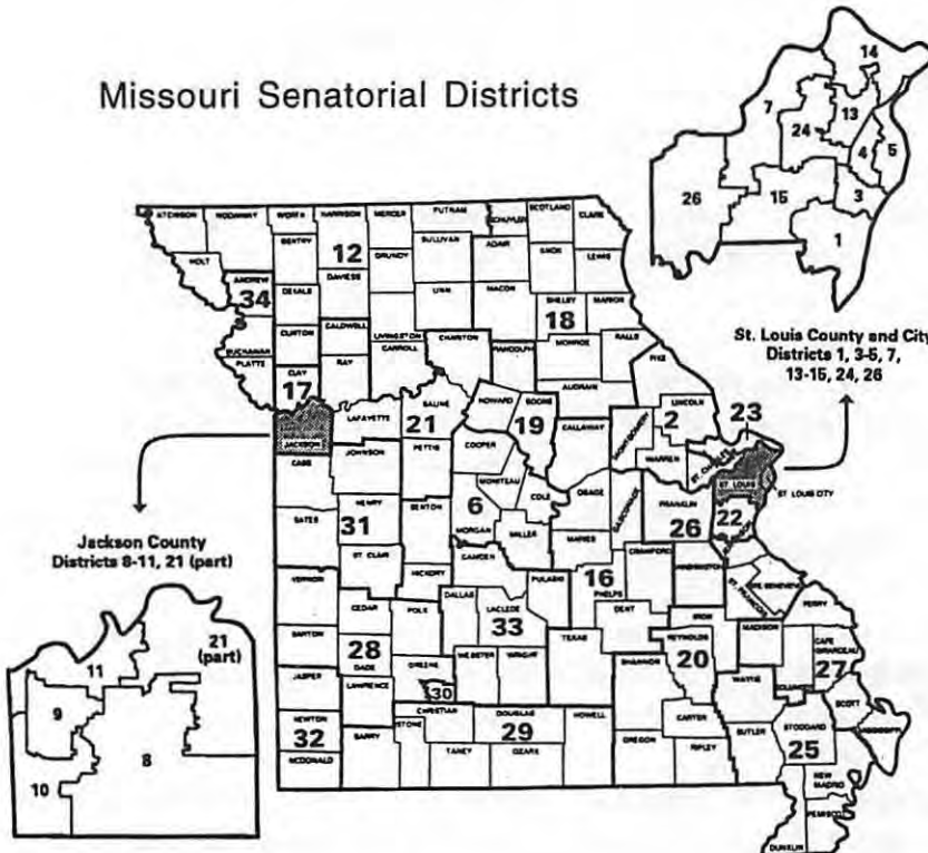
Missouri Senatorial Districts

NOTE: Addresses for your representatives can be found in your local phone book or on the Internet. Or, you can write to: