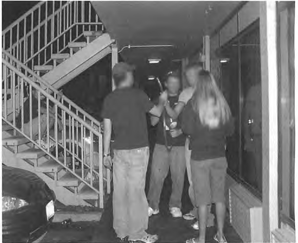
The MSRT banner was hanging on the balcony above where students were drinking.

Number 4: Safety and health concerns cannot be ignored. Binge drinking can lead to alcohol poisoning and accidents. I am not aware of any harm that has befallen a student at the MSRT