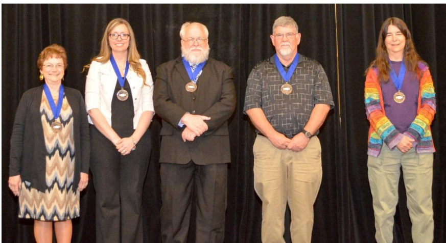
MoSRT 2016 Fellows